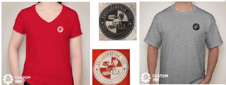
Women sizes- M - L - XL

Order the latest version of the Couillardville t-shirt for someone special in your family. Send a check for $14 (includes tax and shipping & handling) with size and style for each t-shirt to MBF Publishing LLC, 821 Lynnewood Drive, Waukesha, WI 53188