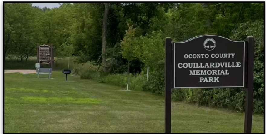
The "heart" of Couillardville is undoubtedly in Couillardville Memorial Park

Saturday, August 15th 11am to 3pm Meadow Brook Farm Couillardville